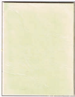
Warm White SGL-112