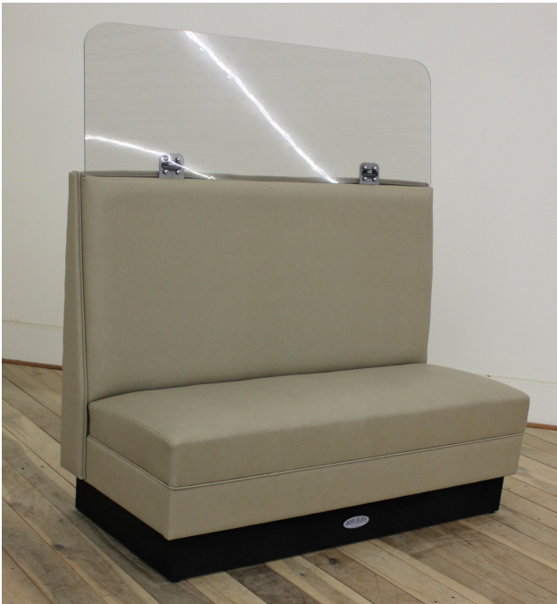
Shield standard as plain panel.

Because CCB custom manufactures these items it may be possible to adapt these shields to other styles of booth and banquette seating as well.