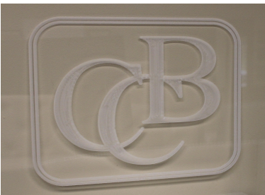
CUSTOM LOGO- example

Heavy Duty Metal Bracket is constructed out of 1/4" Aluminum