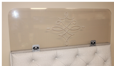
CUSTOM DESIGN or PATTERN- example